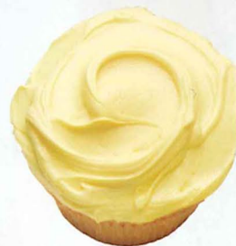
ICING COLOR CHART! Page 88