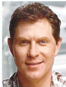
Bobby Flay's GUACAMOLE