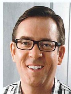
Ted Allen's SPRING PASTA