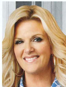
Trisha Yearwood's HOME KITCHEN